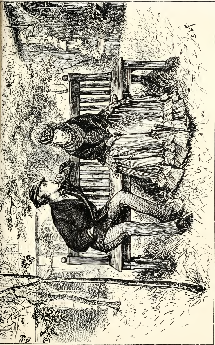
Under the Trees.